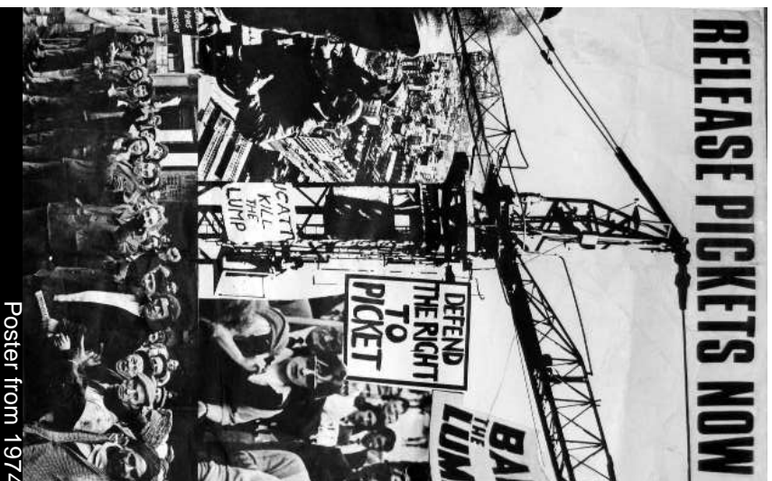
Poster from 1974